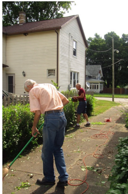
Readying up the parsonage.